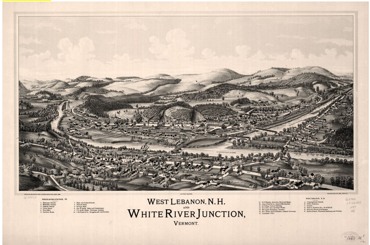
1889 Perspective Map of West Lebanon and White River Junction, Vermont