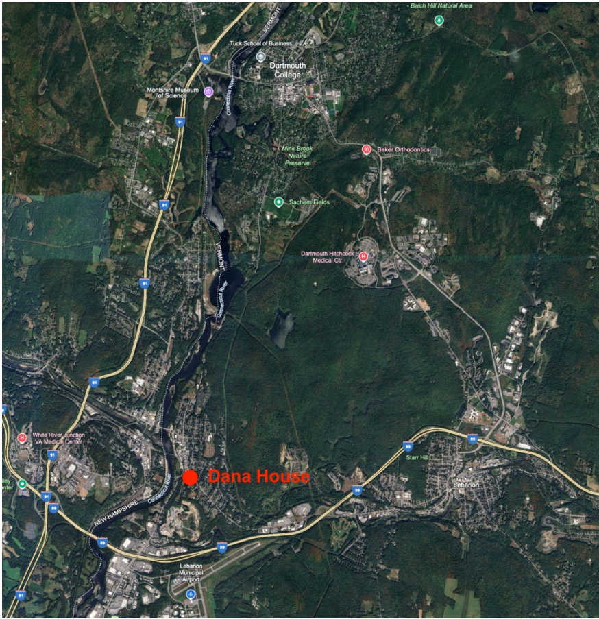
Map of Lebanon and Hanover, New Hampshire, and Hartford and Norwich, Vermont