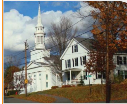
west lebanon congregational church

Historic and cultural resources account for a significant portion of the tourism spending in the state. As the travel and tourism industry becomes a larger segment of the regional economy, opportunities to promote heritage and cultural tourism should be explored. As Lebanon is on the Connecticut River Byway, there are opportunities to promote its cultural heritage through the Connecticut River Byway Council. In addition to creating new jobs and new businesses, well-managed tourism improves the quality of life and builds community pride. Cultural heritage travelers are an attractive market to target, as they tend to stay longer and spend more money, according to the National Trust for Historic Preservation. Perhaps the primary benefit of cultural heritage tourism is the preservation of a community's historic character. However, the largest challenge facing heritage tourism is ensuring that its success does not destroy what attracts visitors in the first place.